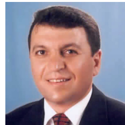
Kamil Kaygusuz Karadeniz Technical University

Energy poverty, “an inability to access modern energy facilities,” is an issue particularly affecting those in developing economies. Rising energy costs and falling household incomes are contributing factors such that ~40% of the population in such countries is unable to adequately heat or cool their homes, and many rely on highly polluting sources. A lack of access to reliable, clean energy adversely affects welfare through both low energy consumption and pollutive fuel consumption—tackling the issue requires transforming our energy systems.