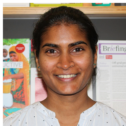
Nipunika Perera International Institute for Environment and Development

Energy is increasingly recognized as a crucial driver for achieving a range of development goals. It helps improve the delivery of vital services such as health and education, yet there is a long way to go to achieve energy access for all.